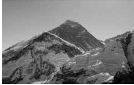
Even the high mountains of today have fossils of sea creatures near their peaks.

rich sand that makes up Uluru must have been deposited very quickly and recently. Long-distance transport of the sand would have caused the grains to be rounded and sorted, whereas they are jagged and unsorted. If they had sat accumulating slowly in a lake bed drying in the sun over eons of time, which is the story told in the geological display at the park centre, the feldspar would have weathered into clay. Likewise, if Uluru had sat in the once-humid area of central Australia for millions of years, it would have weathered to clay. 20 Similarly, the nearby Kata Tjuta (The Olgas) are composed of an unsorted mixture of large boulders, sand, and mud, indicating that the material must have been transported and deposited very rapidly.