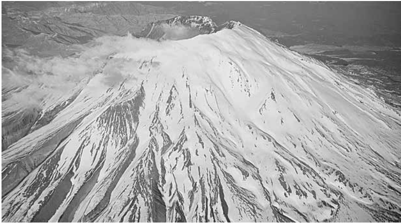
A lot of volcanic activity would be expected with such a cataclysm as the Flood.

There are many volcanic rocks interspersed between the fossil layers in the rock record—layers that were obviously deposited during Noah’s Flood. So it is quite plausible that these fountains of the great deep involved a series of volcanic eruptions with prodigious amounts of water bursting up through the ground. It is interesting that up to 70% or more of what comes out of volcanoes today is water, often in the form of steam.