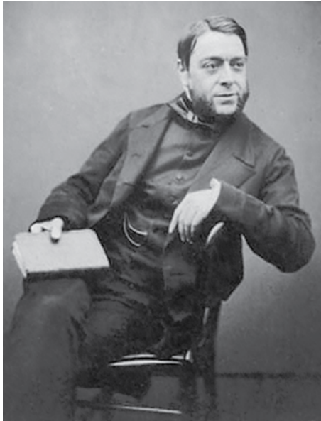
Figure 1. English naturalist Philip Gosse (1810–1888). His 1857 book Omphalos attempted to reconcile biblical creation with apparent geologic ages.

The history of mature creation is incomplete unless the writings of Philip Henry Gosse are considered. This British naturalist has been scoffed at, ridiculed, and vilified for his 1857 book, Omphalos: An Attempt to Untie the Geological Knot . It was published two years before Charles Darwin's Origin of Species , and by then the scientific establishment and virtually the entire British church hierarchy had accepted the idea that the Creation was millions of years old. Omphalos suggests that the world is not nearly as old as geologists assume, but instead is made with a built-in appearance of age. Gosse discusses the cycles of nature including water, soils, rocks and life, and he argues that