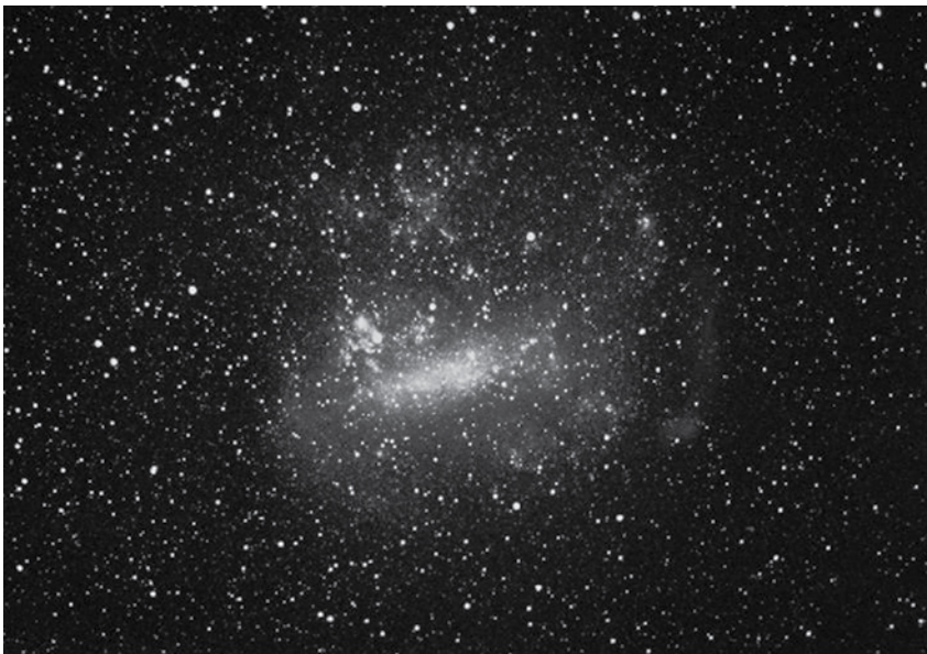
Figure 3. The ‘nearby’ Large Magellanic Cloud Galaxy, about 160,000 light years distant. An exploding star observed here, named Supernova 1987A, is a challenge to the mature creation view.

“A modern cosmologist who was also a theologian with strict fundamentalist views could construct a universe model which began 6000 years ago in time and whose edge was at a distance of 6000 light years from the solar system. A benevolent God could easily arrange the creation of the universe ... so that suitable radiation was travelling toward us from the edge of the universe to give the illusion of a vastly older and larger expanding universe. It would be impossible for any other scientist on the Earth to refute this world picture experimentally ... all he could do would be to disagree.” 27