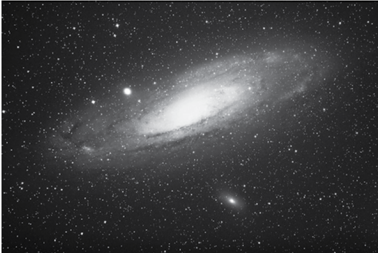
Figure 4. Andromeda Galaxy is one of the most distant objects visible to the unaided eye at 2,500,000 light years. A single light year is about six trillion miles.

It should be noted that a time dilated universe also cannot be refuted experimentally.